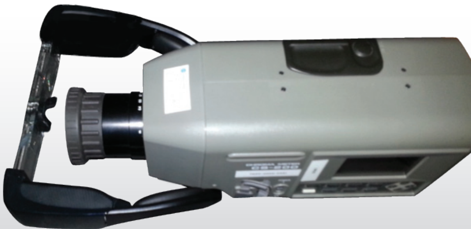
Figure 1: Use of CS-200 to capture Color