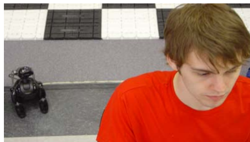
Figure 3. How AIBO Surrogate appears in the real world