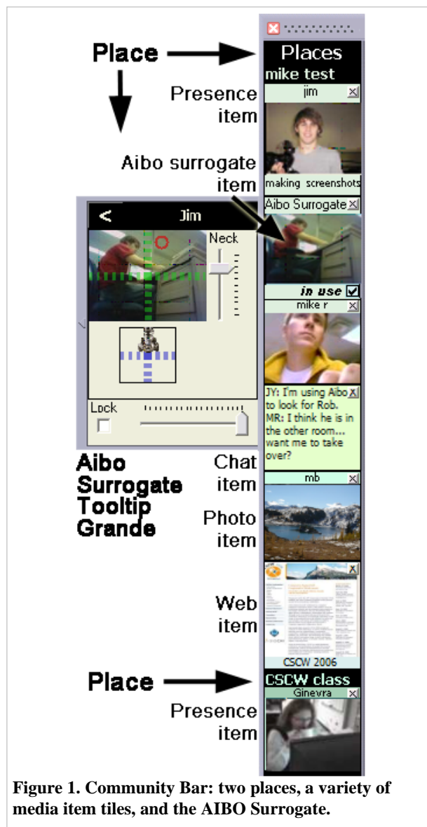
Figure 1. Community Bar: two places, a variety of media item tiles, and the AIBO Surrogate.

We suggest using a mobile robot as a substitute for the distant group. We believe robots can enable a distance-separated group to extend their