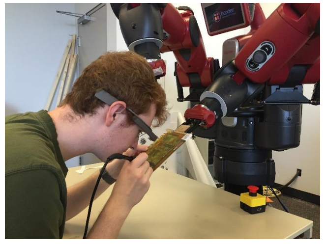
Figure 1. A user controls a robot to help them solder, seeing the perspective from the robot's hand camera in Google Glass.

Permission to make digital or hard copies of all or part of this work for personal or classroom use is granted without fee provided that copies are not made or distributed for profit or commercial advantage and that copies bear this notice and the full citation on the first page. Copyrights for components of this work owned by others than ACM must be honored. Abstracting with credit is permitted. To copy otherwise, or republish, to post on servers or to redistribute to lists, requires prior specific permission and/or a Request permissions from Permissions@acm.org. fee. HAI 2015, October 21-24, 2015, Daegu, Kyungpook, Republic of Korea 2015 ACM. ISBN 978-1-4503-3527-0/15/10..$15.00 \bigcirc DOI: http://dx.doi.org/10.1145/2814940.2814995